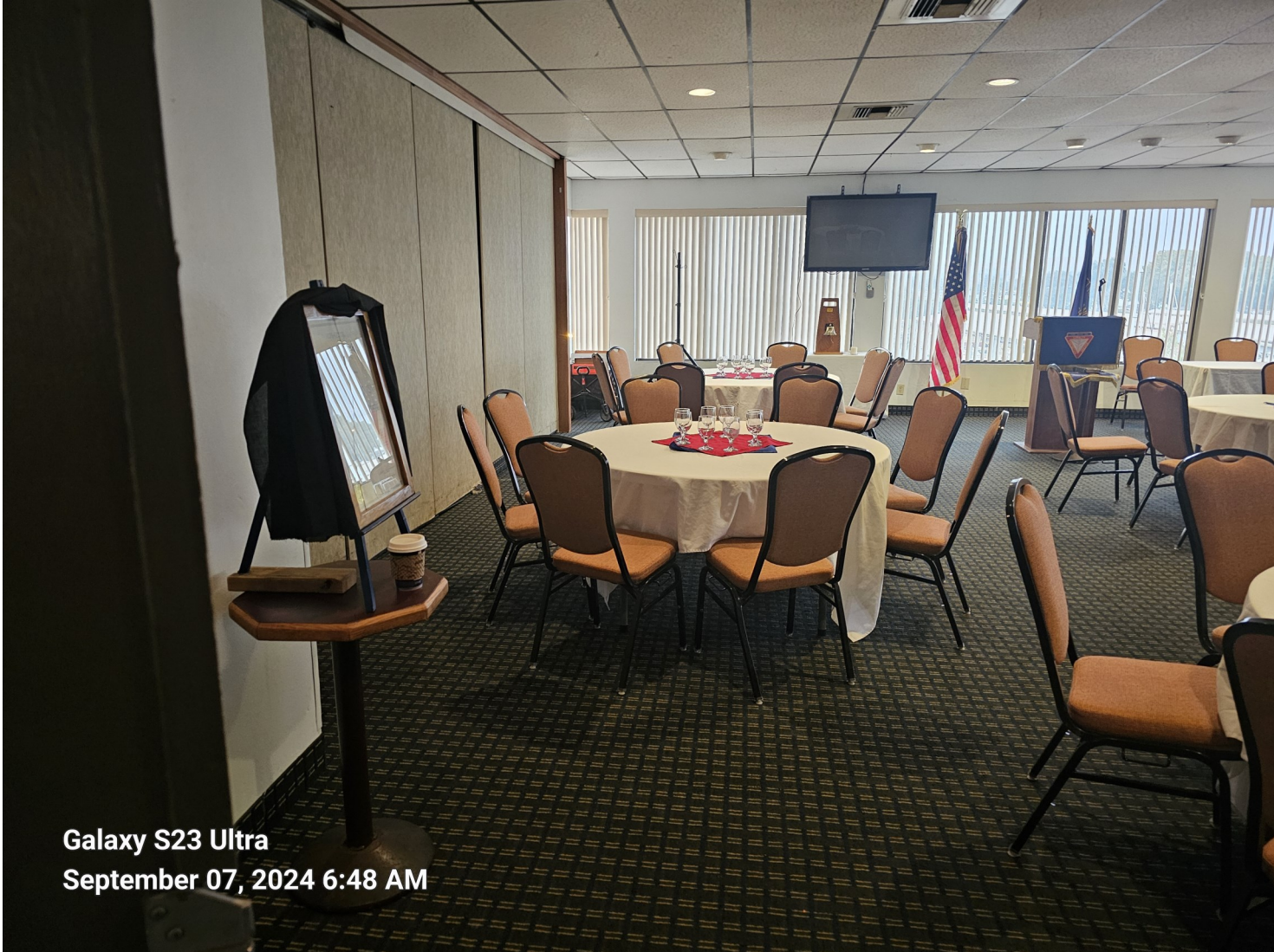
Galaxy S23 Ultra September 07, 2024 6:48 AM