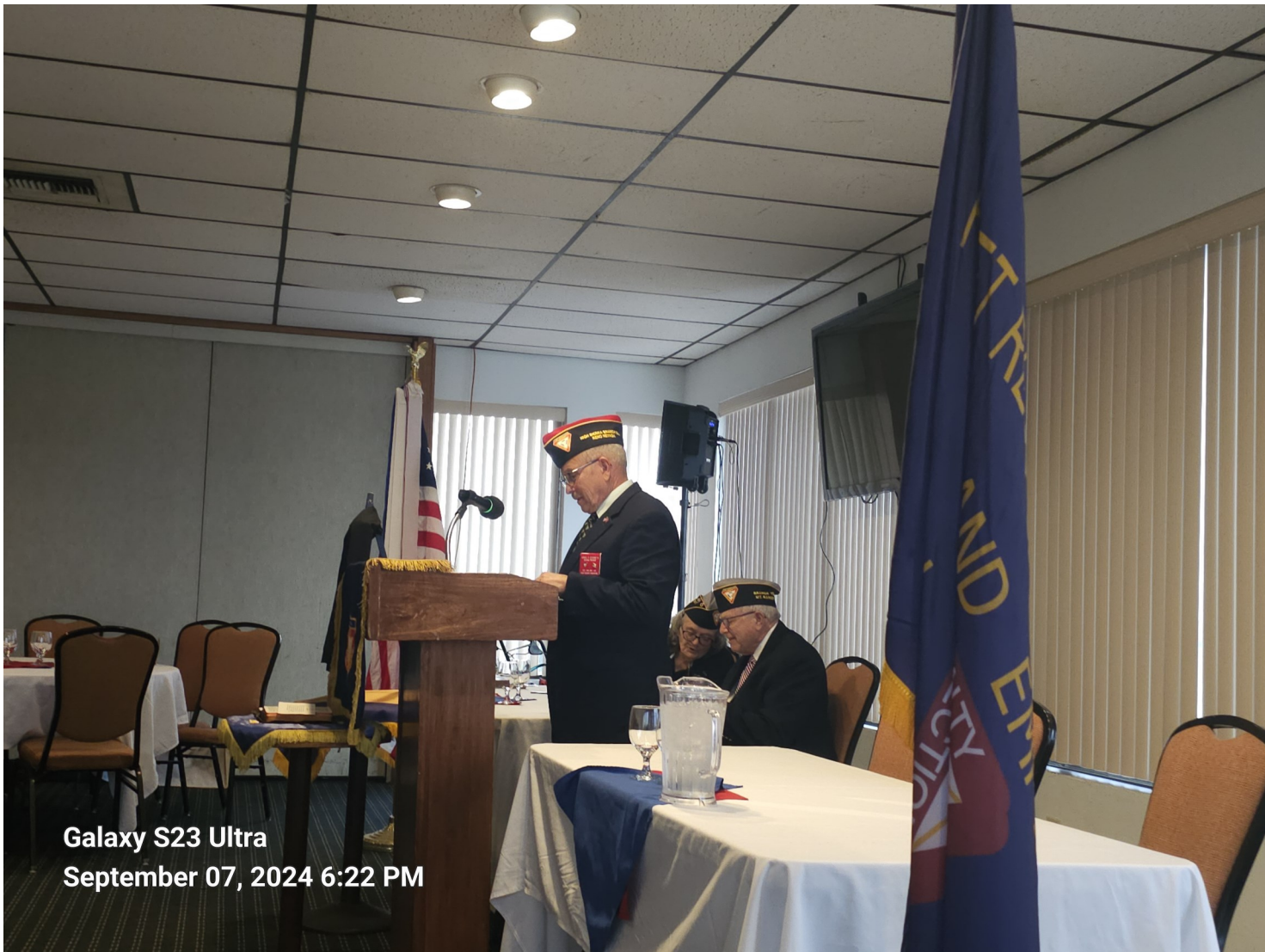
Galaxy S23 Ultra September 07, 2024 6:22 PM