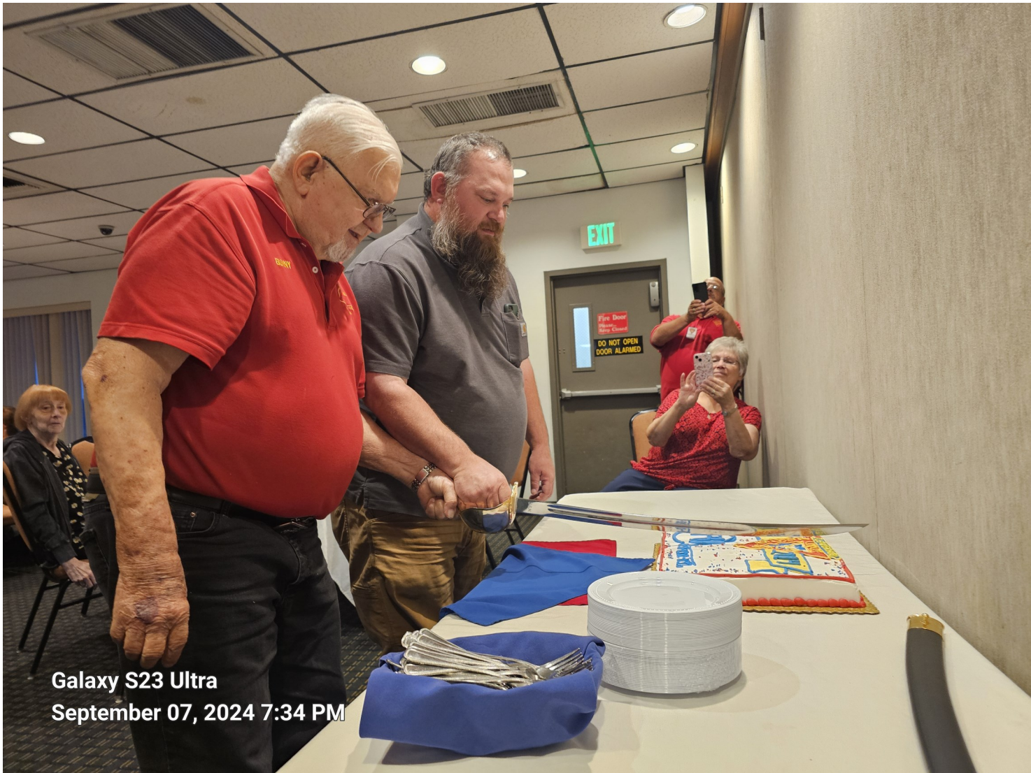
Galaxy S23 Ultra September 07, 2024 7:34 PM