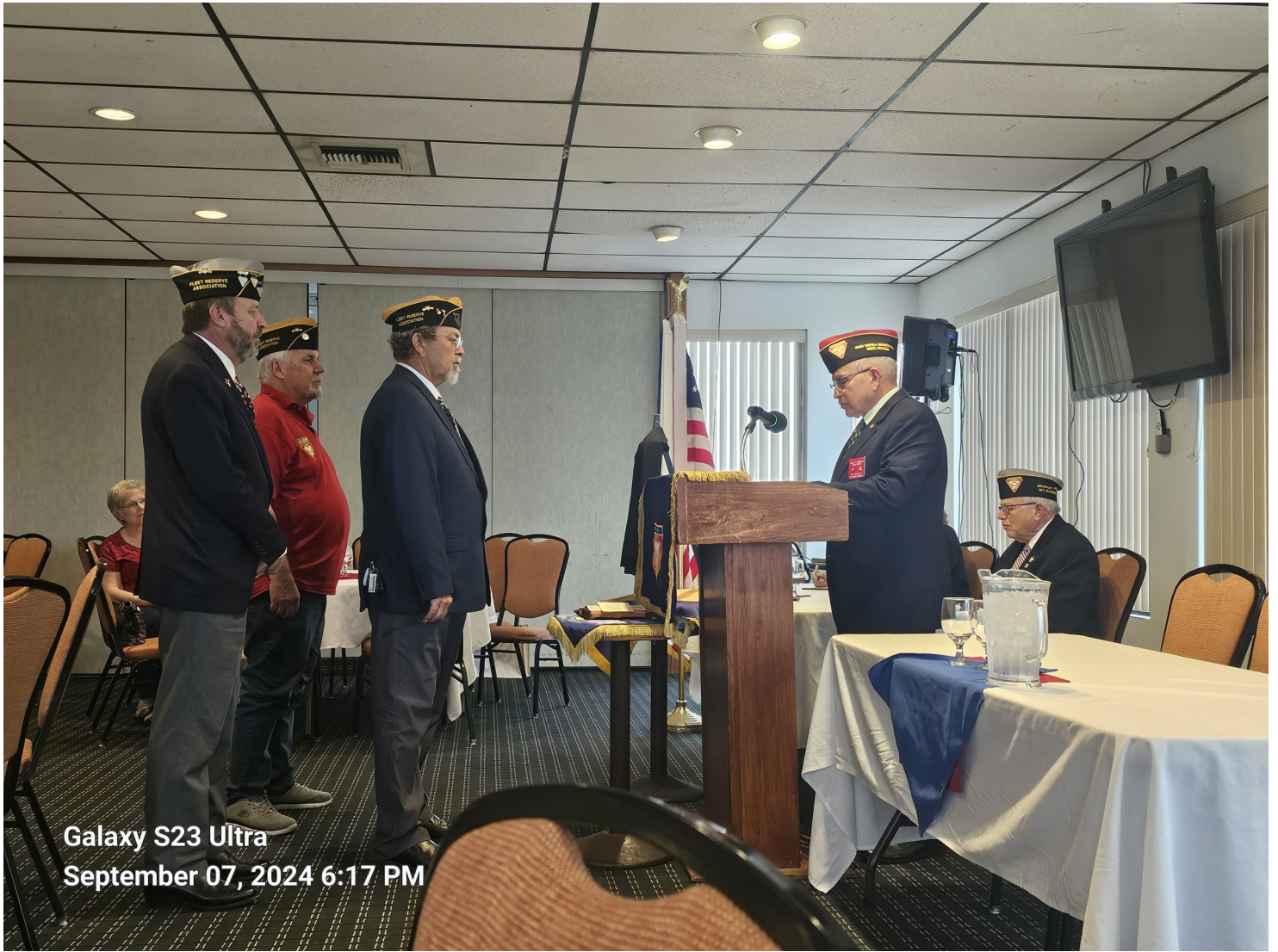
Galaxy S23 Ultra September 07, 2024 6:17 PM