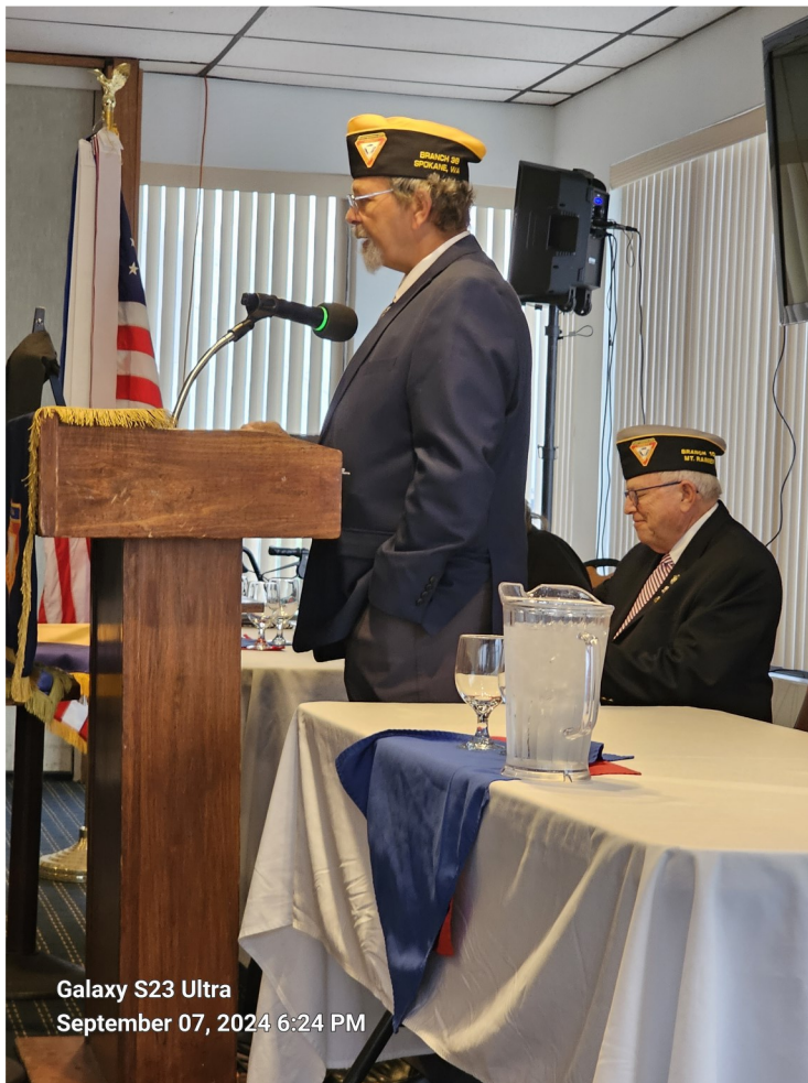
Galaxy S23 Ultra September 07, 2024 6:24 PM