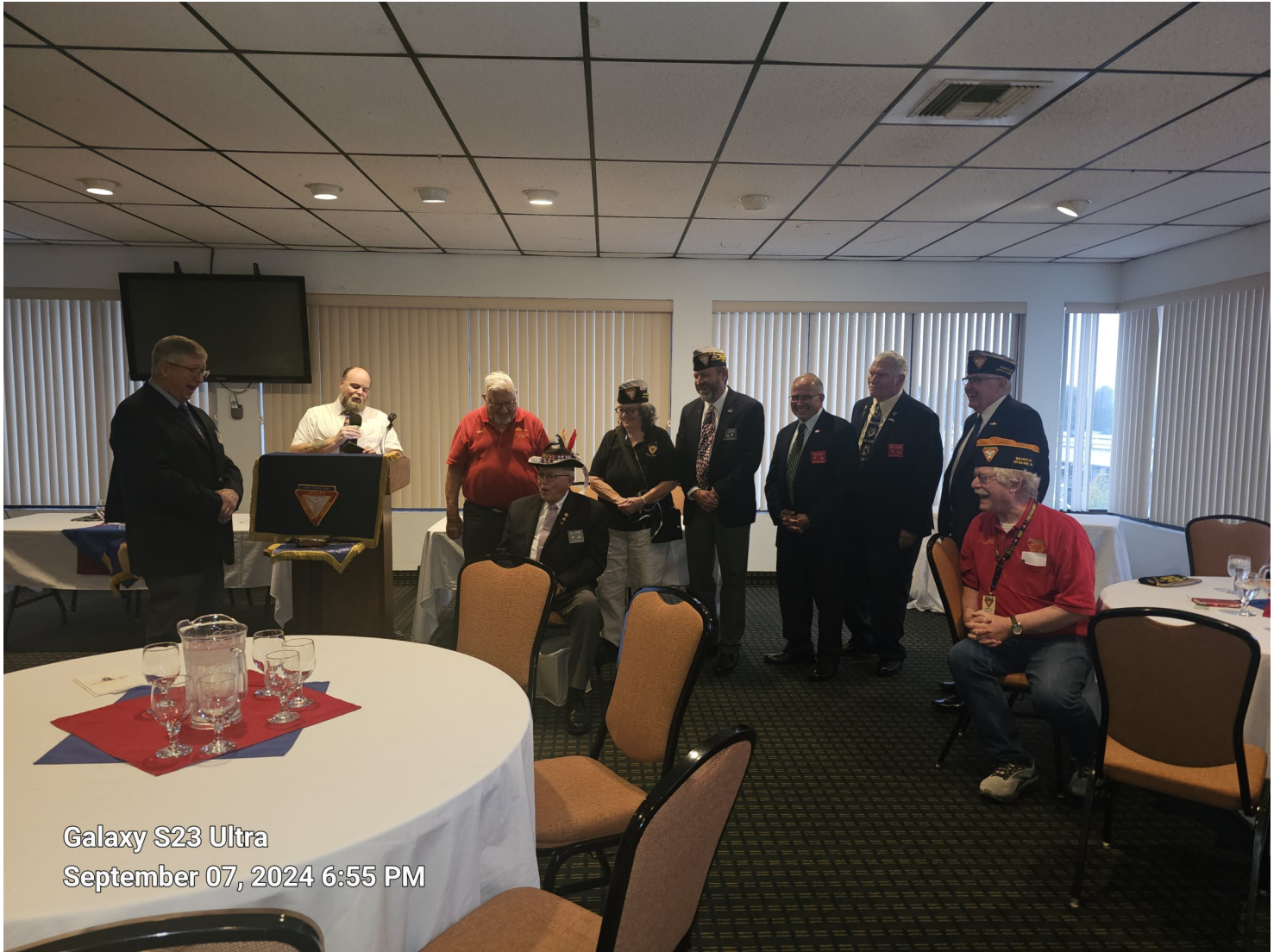
Galaxy S23 Ultra September 07, 2024 6:55 PM