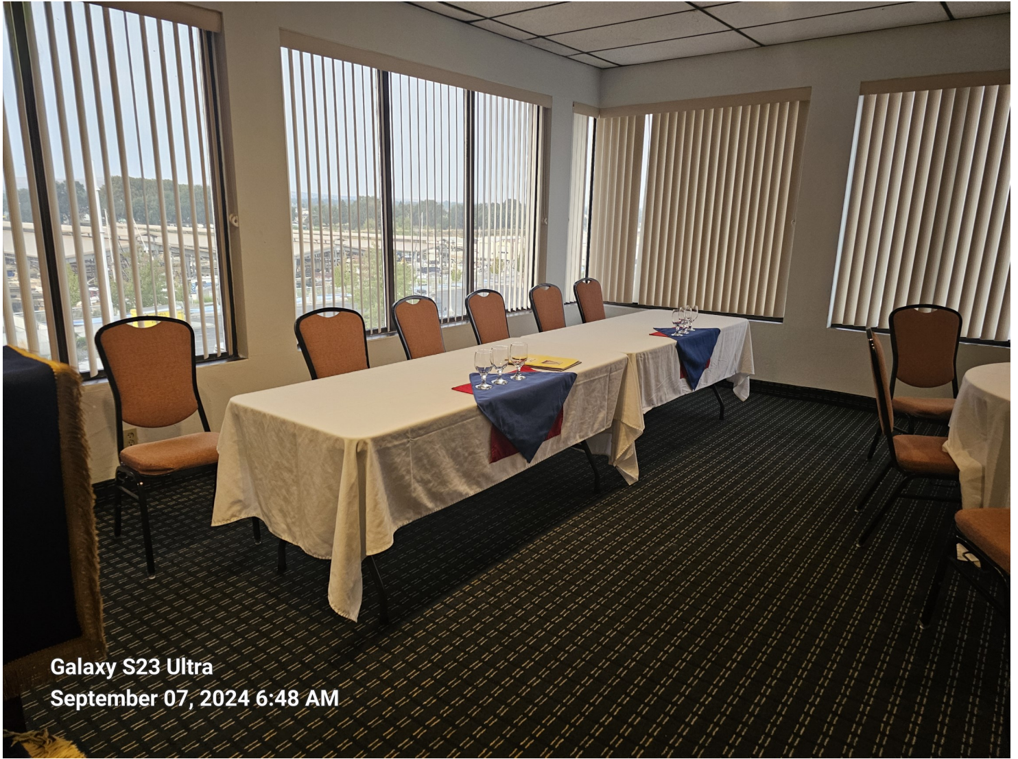
Galaxy S23 Ultra September 07, 2024 6:48 AM