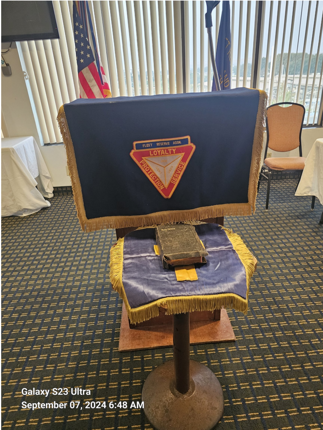
Galaxy S23 Ultra September 07, 2024 6:48 AM