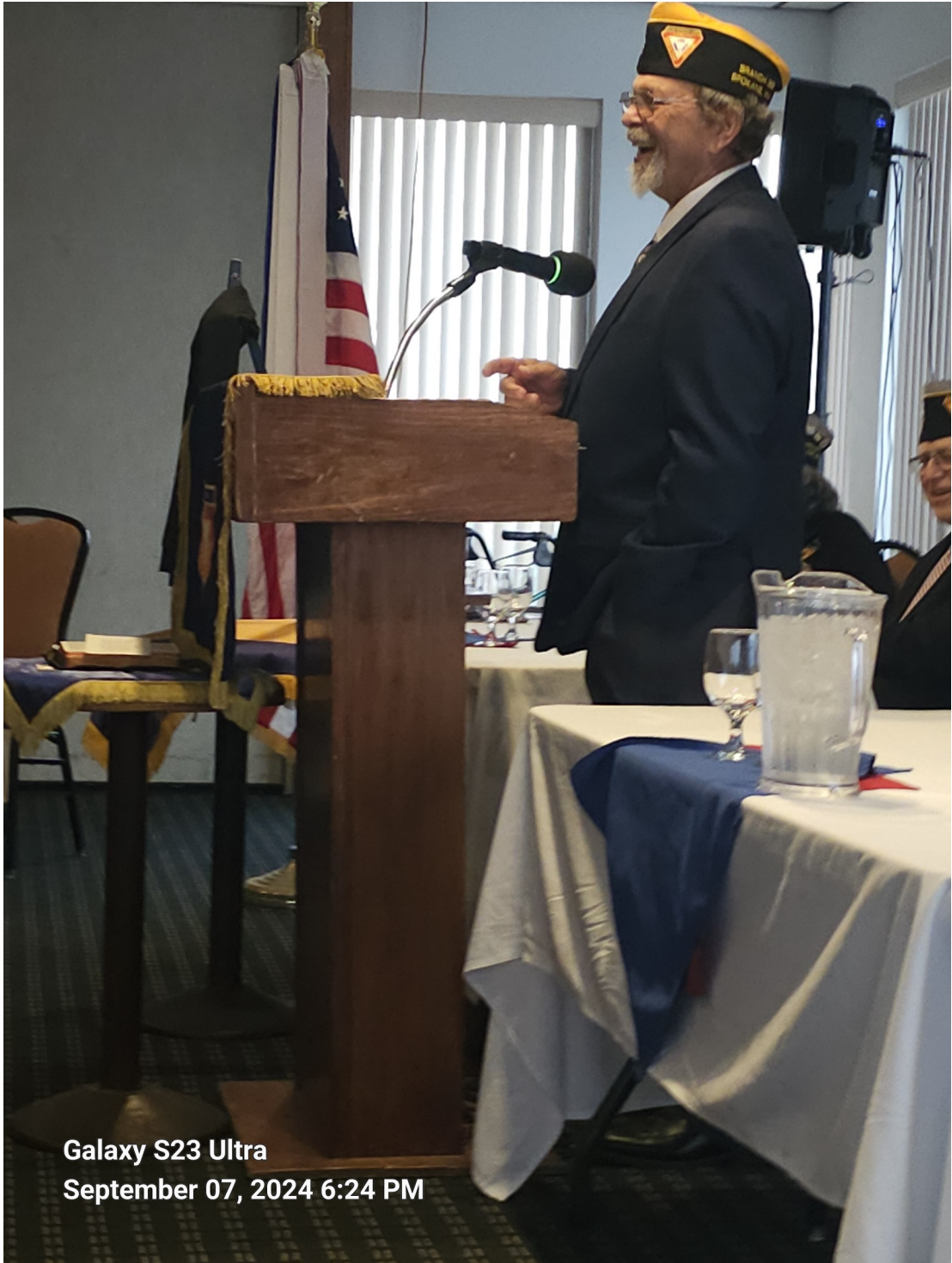
Galaxy S23 Ultra September 07, 2024 6:24 PM