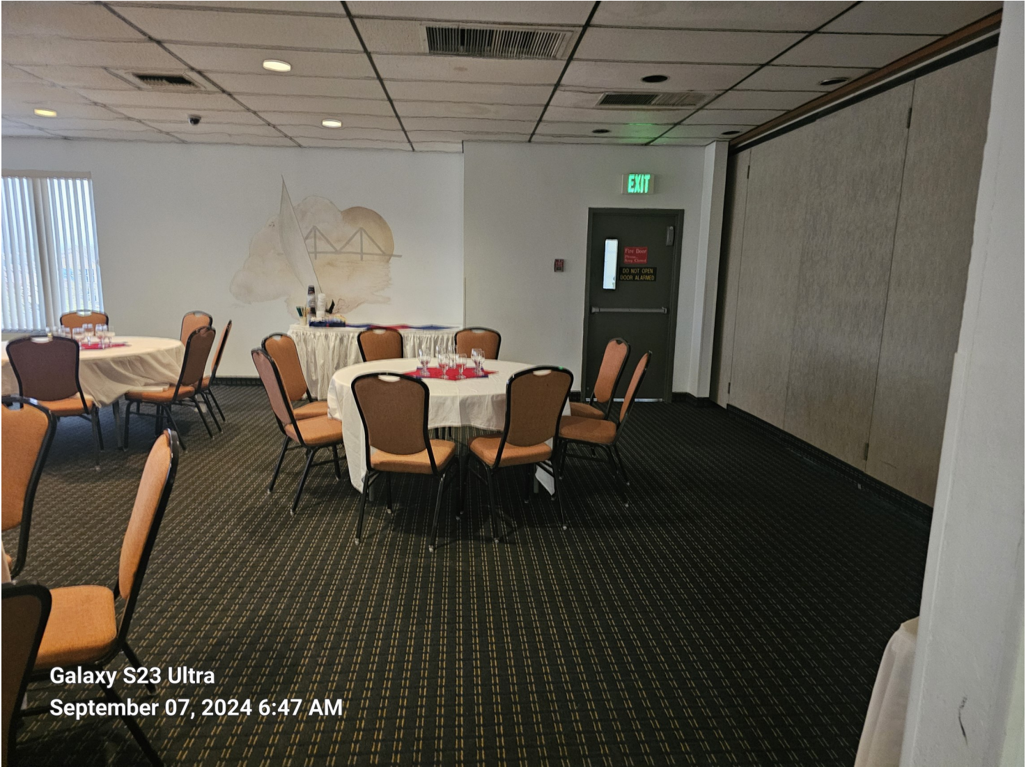
Galaxy S23 Ultra September 07, 2024 6:47 AM