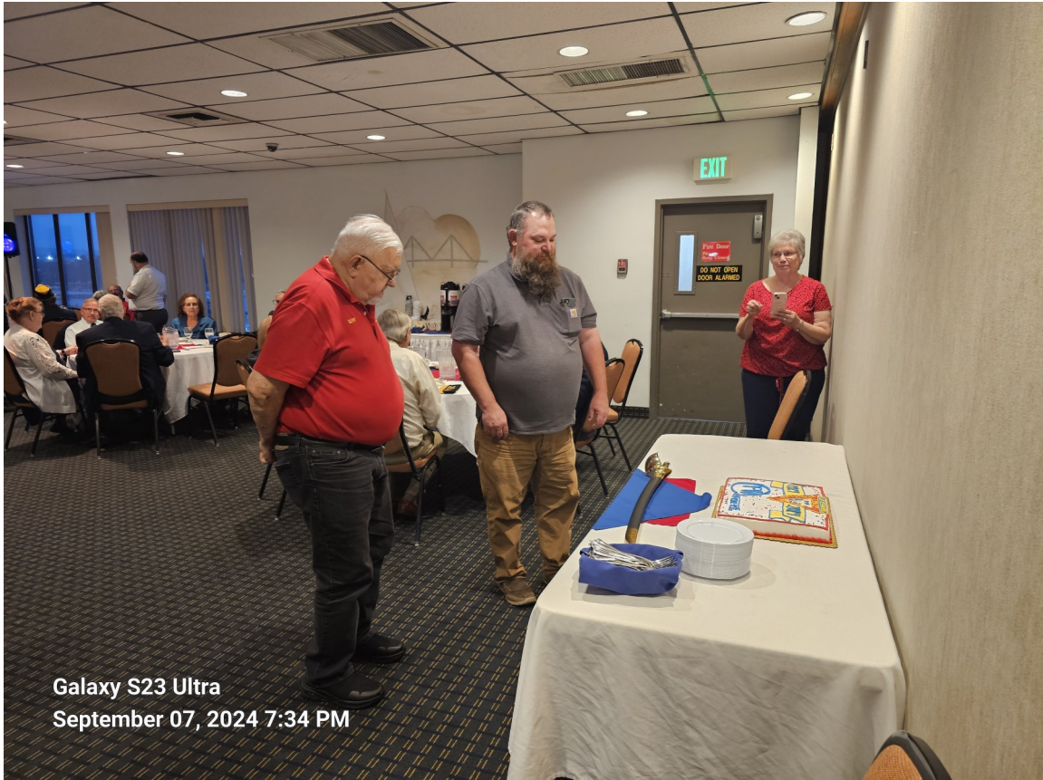
Galaxy S23 Ultra September 07, 2024 7:34 PM