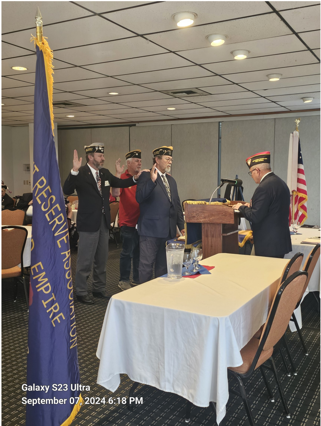
Galaxy S23 Ultra September 07, 2024 6:18 PM