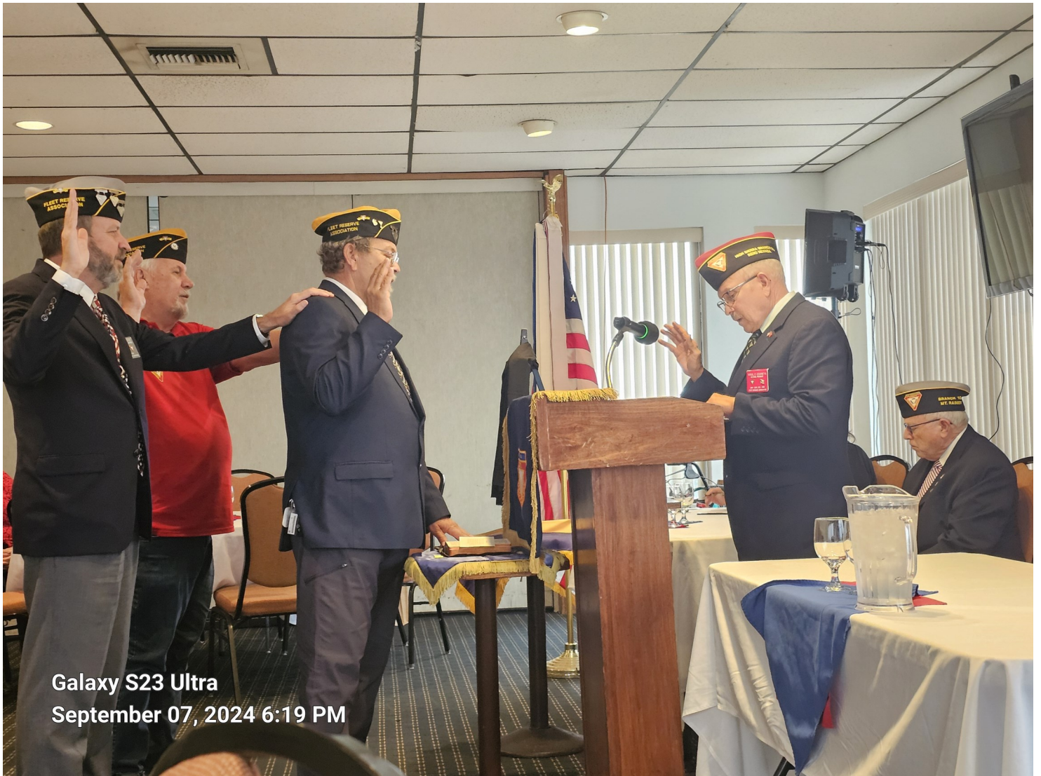
Galaxy S23 Ultra September 07, 2024 6:19 PM