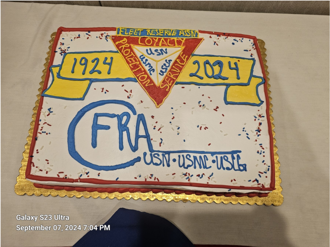
Galaxy S23 Ultra September 07, 2024 7:04 PM