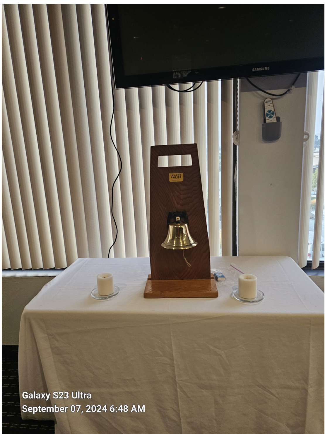
Galaxy S23 Ultra September 07, 2024 6:48 AM